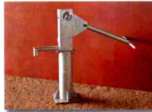
AFRIDEV HAND PUMP