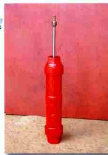
SDWP. EDWP CYLINDER