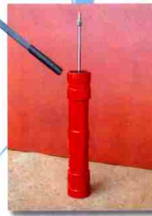
VLOM- 65 CYLINDER