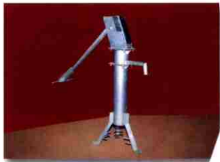
EXTRA DEEP WELL HAND PUMP