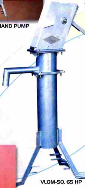
VLOM-50. 65 HP